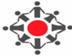
PERSHORE MEDICAL PRACTICE